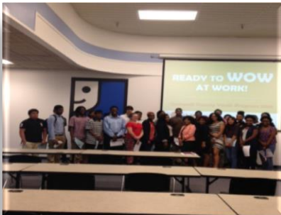
Youth Job Fair