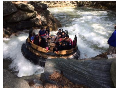
Six Flags Over Ga.