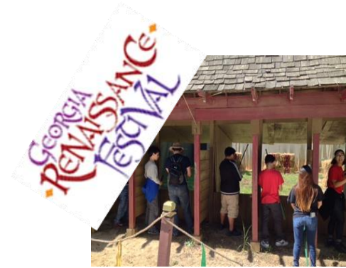
GA. Renaissance Festival