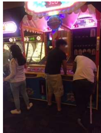
Dave & Busters