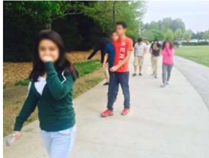
Lilburn Park Relay for Life